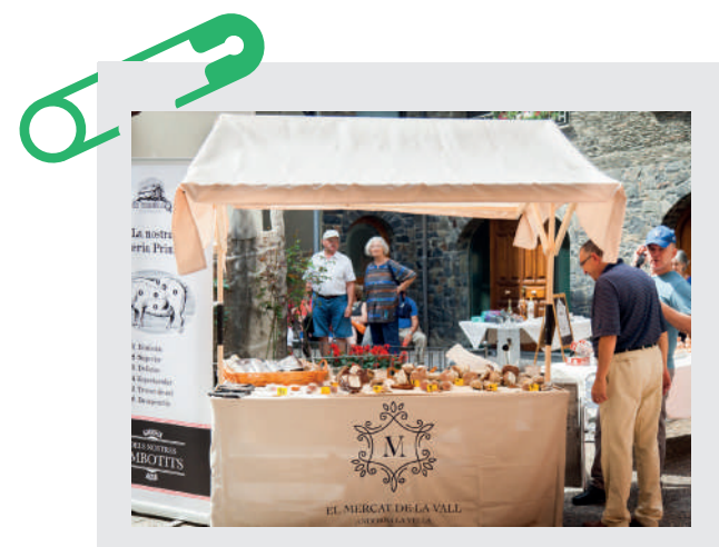
Come by the Barri Antic every first Saturday of the month and find all the farm products, crafts, flea market items and much more on offer at the Mercat de la Vall.