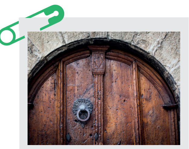
If you want to take home a nice souvenir of Andorra la Vella, take a photo of the traditional façades and doors of the buildings in the historic centre, the most iconic being the Casa de la Vall, the country's old parliament.