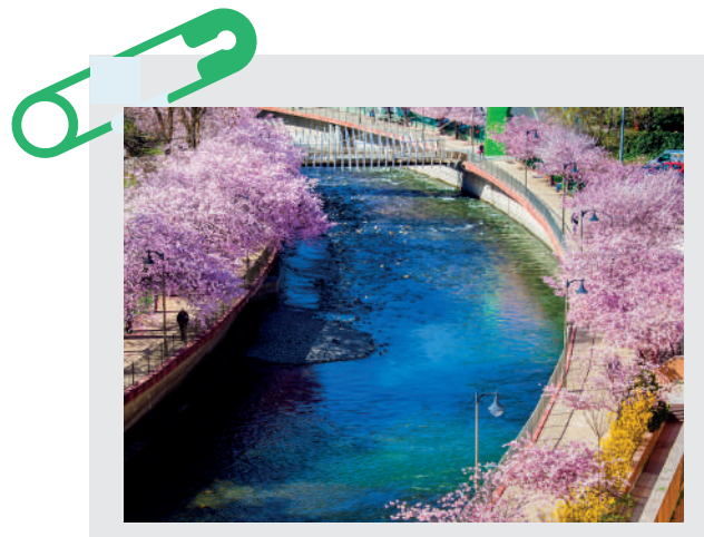
A relaxed stroll along the river can become an unforgettable experience. Walk along the Passeig del Riu and relax under the shade of the cherry blossoms on both sides of the Valira River.

Andorra la Vella in the spring is more beautiful than ever. Visit us from April to June and explore every nook and cranny of the highest-altitude capital in Europe. In spring you must not miss: