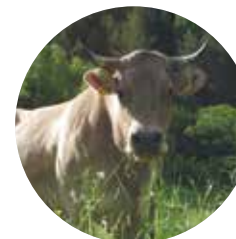
Andorran brown cow