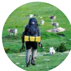
Hiking in Perafita

La Nou lake: From the Romanesque noc , coming from the Latin naucu (derived from navis ), related in this case with hydronymy. The nature of this lake and its water supply system lead one to think it is fed by subterranean water.